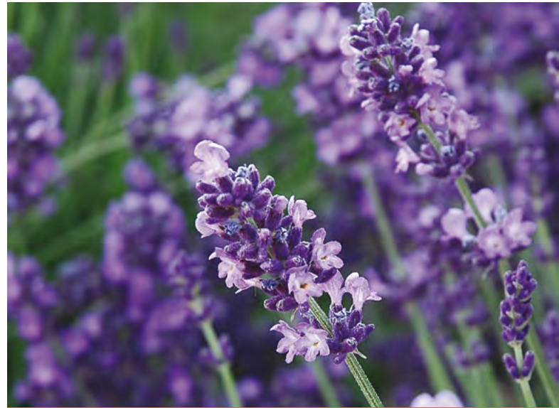
Lavandula angustifolia – common name Riverina Eunice.

"Boosting grower confidence in the future of the industry is at the core of this work, and we look forward to achieving this through a combination of scientific expertise and dedicated