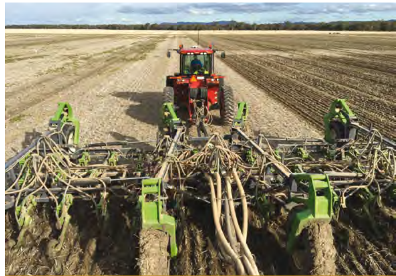
Large scale modern farm machinery has enabled farmers to do their own on-farm replicated trials.

There were four P rate treatments (0, 8.8, 17.5 and 35 kg P applied with Granulock Z) and three replicates. In each replicate the four individual P treatments were applied with three seeder