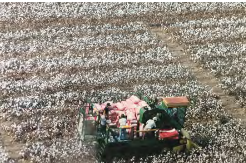
Picking variety trials at Norwood in 1994.