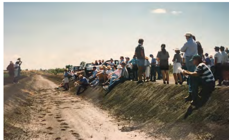
Norwood featured in the 1996 Gwydir Valley field day.