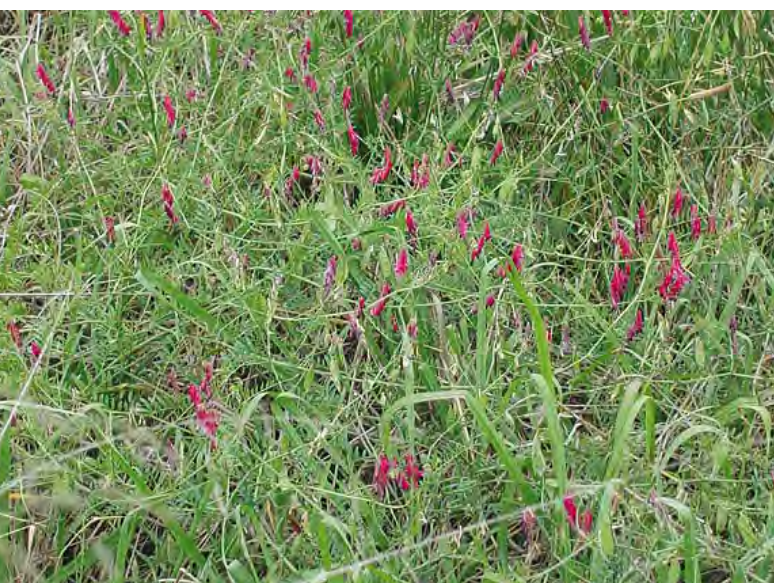
The benefits of brown manure legume crops become more apparent in the second year onwards.

For those with livestock of their own, or access to agistment,