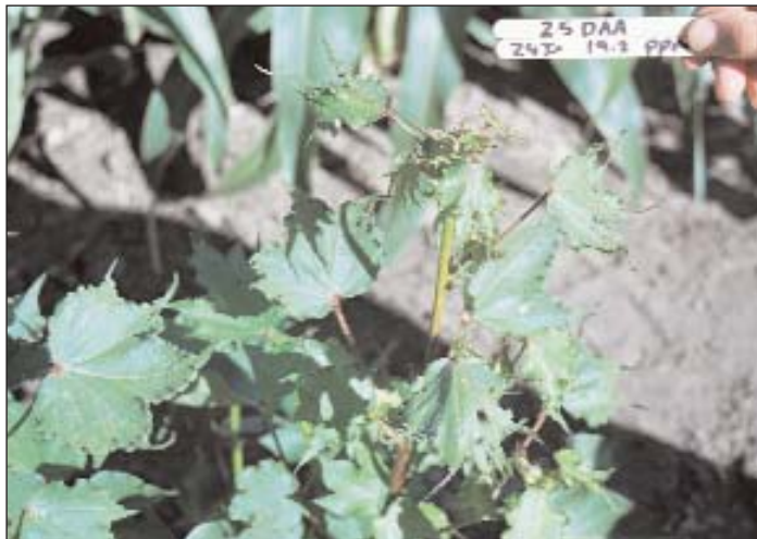
The effect of 2,4-D at 19.2 ppm: Thirteen days after application (left) and 25 days after application (right).