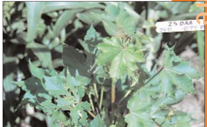
The effect of 2,4-D at 0.077 ppm: Thirteen days after application (left) and 25 days after application (right).

April 1, is being considered by the Gwydir Valley Cotton Growers Association.