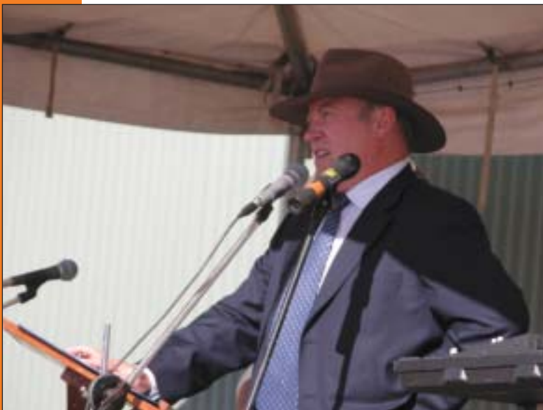
NSW Minister for Primary Industries, Ian Macdonald.