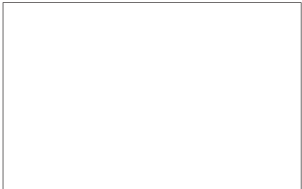
The Macquarie Cotton team.