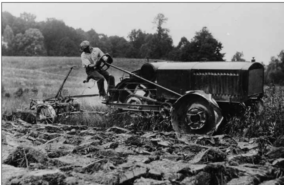
Deere and Co released its second in-house designed tractor in 1916. Note the three-wheel drive configuration. Although a reasonable performer, the cost of production rendered it uncompetitive and only around 200 units were manufactured. At least one example remains in the US and is insured for a figure in excess of one million US dollars.