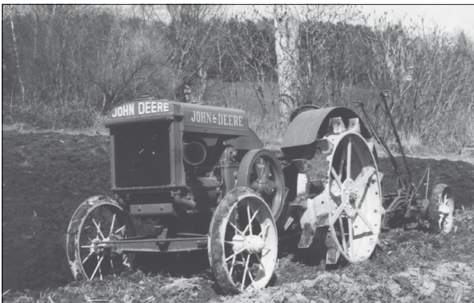
Photo shows an early example of a John Deere Model D. Note the spoked flywheel, which proved extremely hazardous to the operator, when pulling the flywheel over to start the engine.