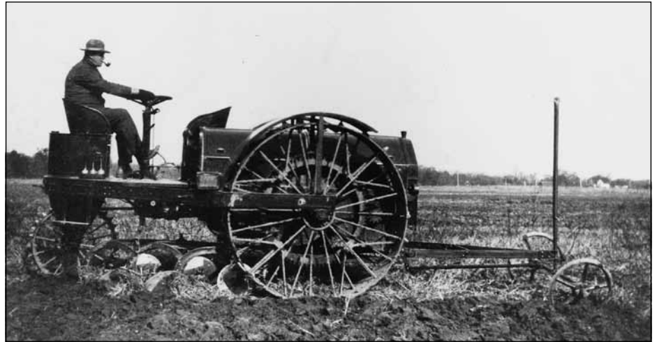
Pictured is the very first tractor designed and manufactured by Deere and Co in 1914. The complicated three-wheel design proved to be inefficient and unreliable and was not developed beyond the prototype stage.

(Before proceeding, please note – I was not involved in the script writing of Sir Humphrey's lines in 'Yes Minister'!)