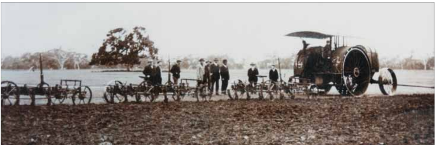
A historic photo of The Big Four operating at the beginning of the twentieth century in the Parkes district. Note the three horse ploughs which the big tractor would have hauled effortlessly. John Deere entered the world of farm tractors with a marketing arrangement of the Big Four with the Transit Thresher Company of Minneapolis which, during that period manufactured The Big Four.