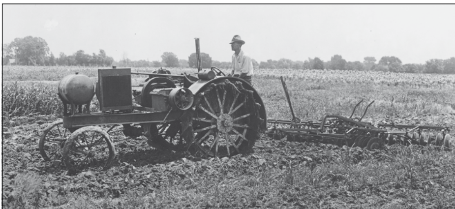
A historic photo of an early Waterloo Boy hauling a set of disc harrows in Iowa.

In recent years, twin cylinder John Deere tractors have become greatly treasured by collectors and museums around the world.