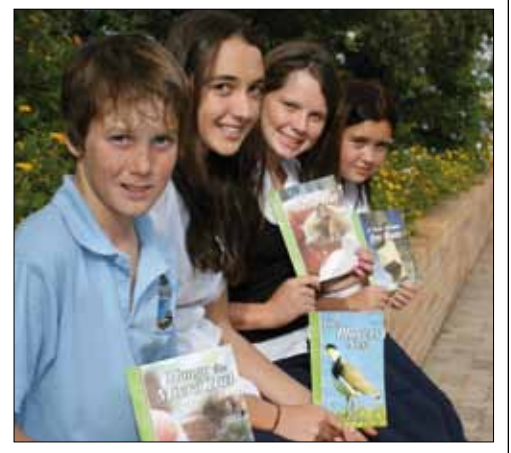
The Enviro Reader Award winners from Narrabri Public School.