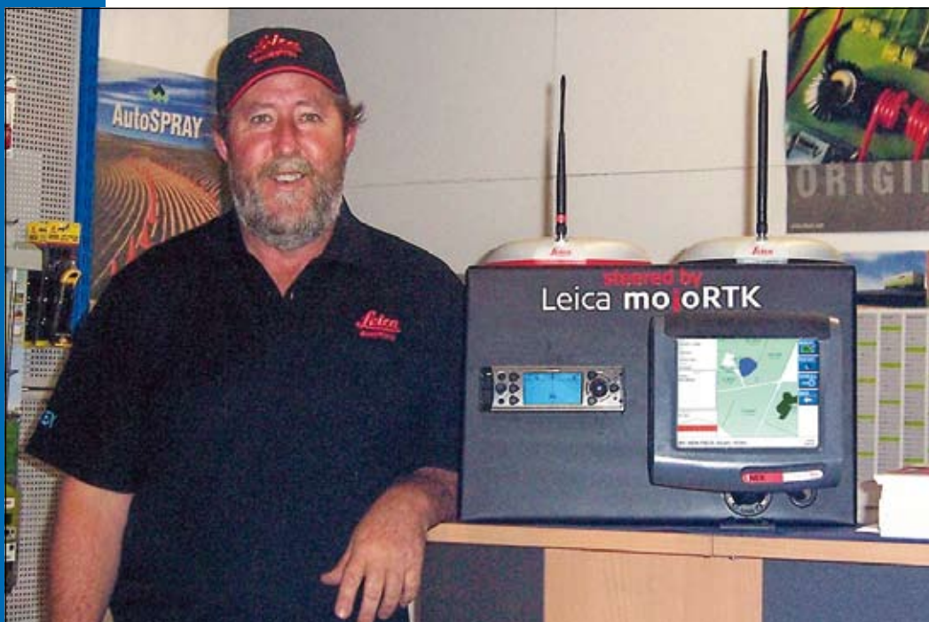
The Leica Geosystems RTK network continues to roll out.

Pricing for GPSnet access and data plans has now been released, with a cost structure that reflects the network rollout and no joining fees. As a Value Added Reseller for GPSnet, Leica Geosystems is able to offer customers a combined solution that includes a mojoRTK network-ready console ($14,990 RRP ex GST), GPSnet access and NextG data, with options to purchase a 1, 3, 6 or 12 month access plan to suit individual requirements.