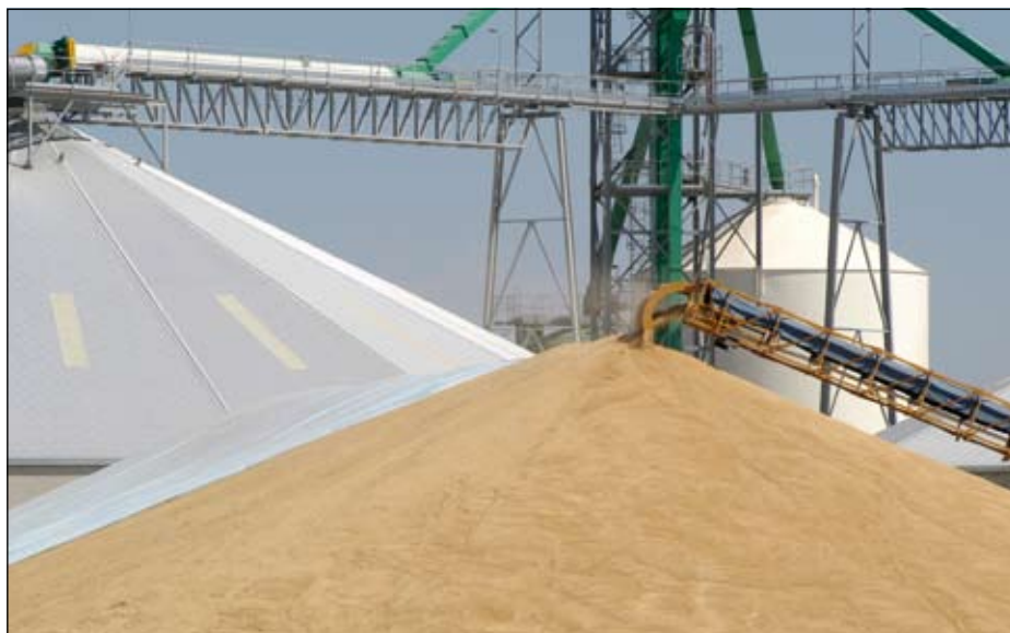
For the past seven years the world has consumed more grain than it has grown.

The present food crisis is a forewarning of what the world can expect in the decades ahead as civilisation runs low on water, arable land, nutrients and technology, as marine fish catches collapse, as biofuels