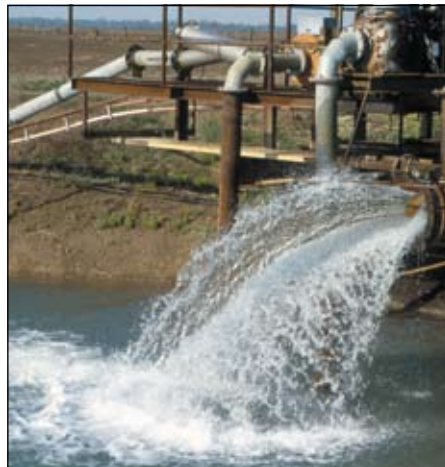
The world will need a 200 per cent increase in irrigation water use efficiency across all crops