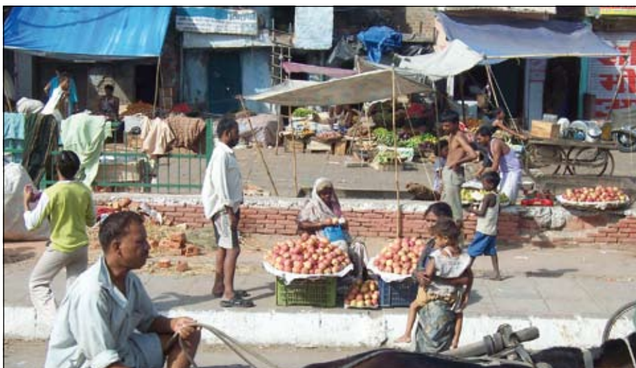
Civilisation and anarchy are only seven meals apart: To avoid war and refugees – food and water security is paramount.

This is nevertheless an exciting time for farming. For the first time in over 40 years, the terms of trade are swinging in farming's favour. Costs are rising – but so too are commodity prices. There has never been a better time in the past two generations to be a farmer, an agricultural scientist or someone who works in, or for, agriculture. Once more, young agricultural professionals are being challenged to feed and clothe the world. Once more governments are being forced to pay attention to their needs.