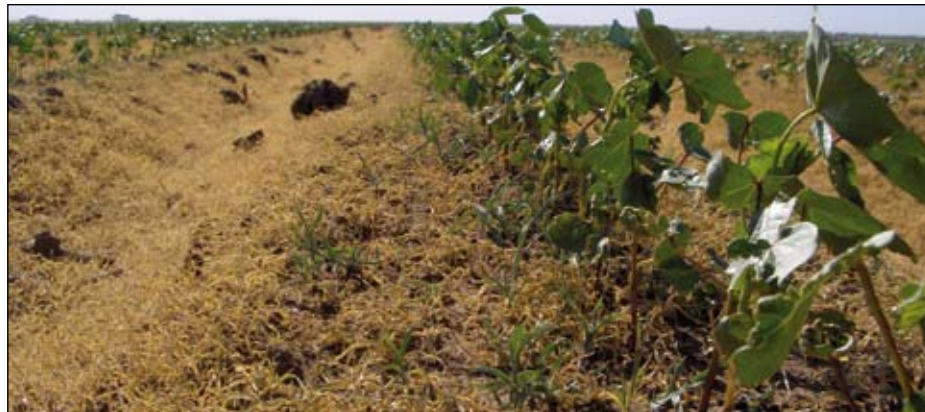
The level of weed control achieved and any subsequent weed germinations should be monitored closely.

Moisture stress and spray coverage issues can arise where heavy weed infestations occur. Often the first application will need to be made earlier when weeds are small (one to two leaf), and a follow up application close behind the first required to control any weed escapes and subsequent weed flushes. This will generally clean up the tougher or more easily stressed weed species before they are able to develop a stronger root system or set seed.