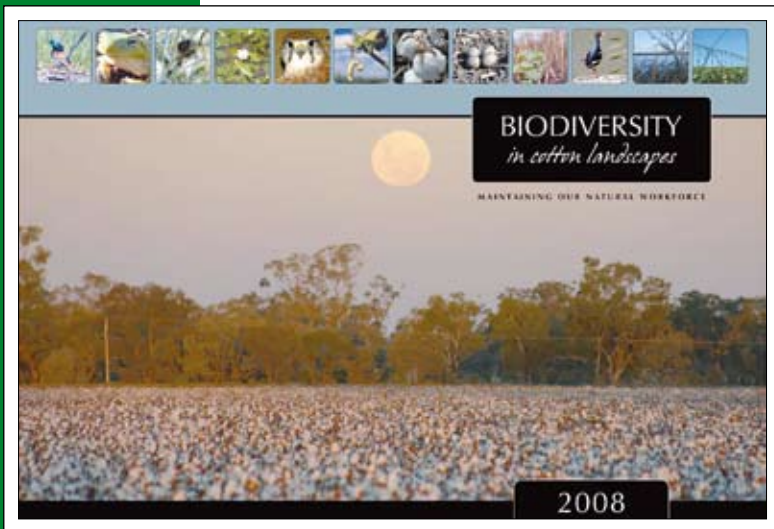
The "Biodiversity in cotton landscapes" calendar has been very popular.

Quantifying the provision of other ecosystem ...84▷