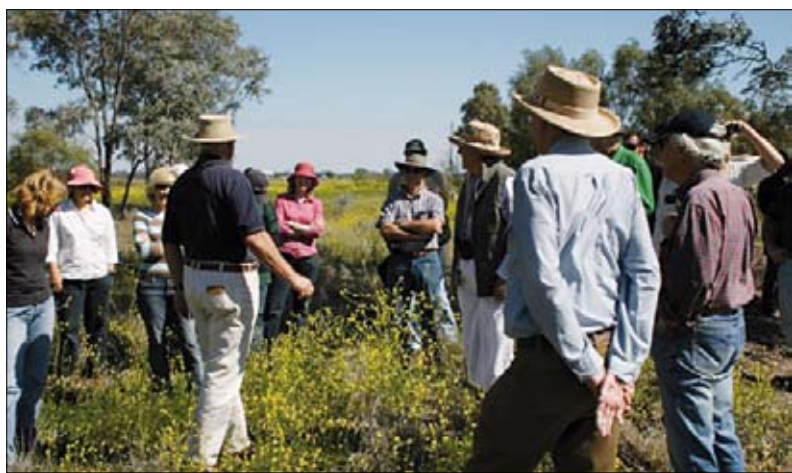
Many cotton growers are showing a keen interest in biodiversity principles.

Finally the results and principles from the current research on biodiversity are being used in structuring the revised BMP program. This reinforces many of the good farming practices already promoted in the research reviews, field days, and the biodiversity calendar and fact sheets. It continues to raise the profile of biodiversity and why it is important to promote and maintain it in cotton landscapes.