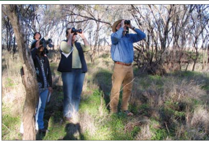
The “Birds in Cotton” field day was well supported.