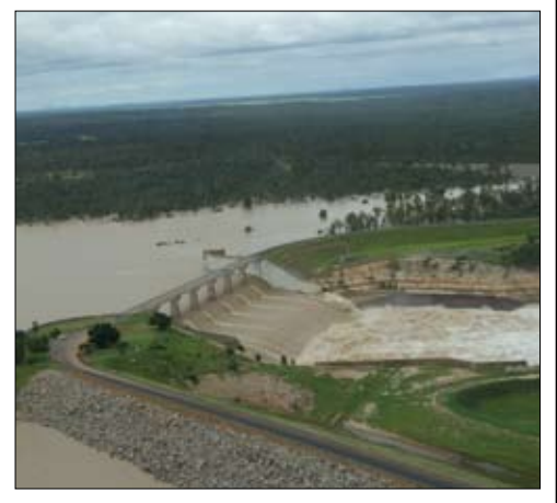
The Fairbairn spillway was an impressive sight.