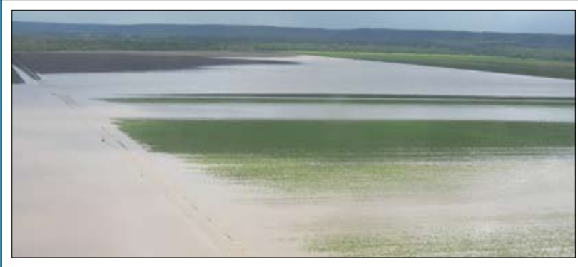
Some crops were totally inundated.