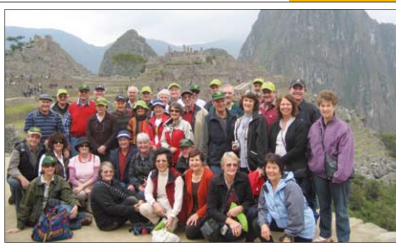
Machu Pichu leaves a lasting impression on all visitors.