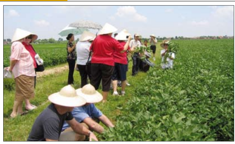
The peasant hats didn't fool anyone in Vietnam.