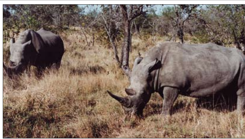
The animal "pests" in African farming present their own unique challenges.