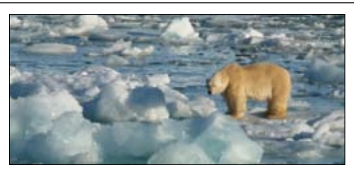
We carefully navigated around the polar bears.

way through their magnificent livestock. We cooled our heels on advancing glaciers, enjoyed high pressure showers at Iguassu, had the wool cover our eyes in the Argentine Pampas, mingled with drug-lords in Rio and had our collective breaths taken away at La Paz and Machu Pichu.