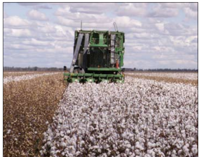
Clinton Freer picks the seed treatment trial located at 'Greenbah' Wee Waa.