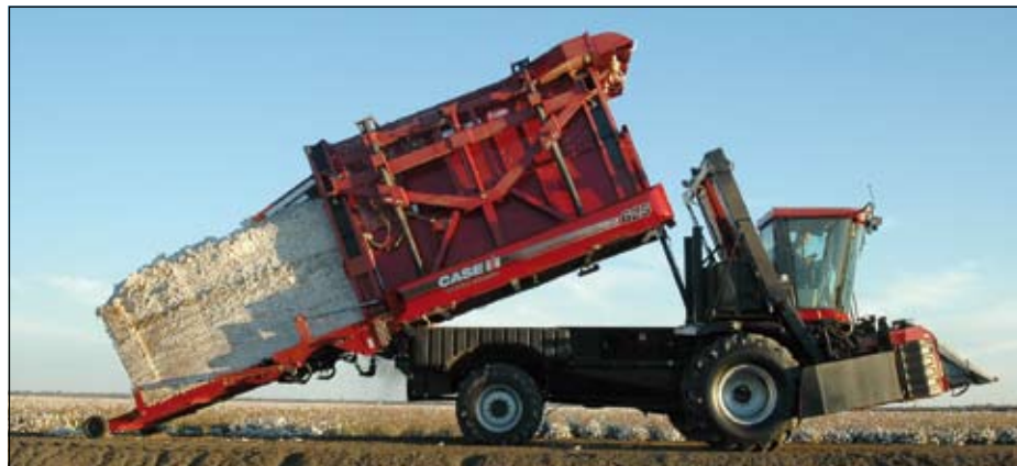
Case IH will officially launch the Module Express 625 at the Cotton Conference in August. The Module Express 625 is the first commercial cotton picker that can build modules as it harvests.