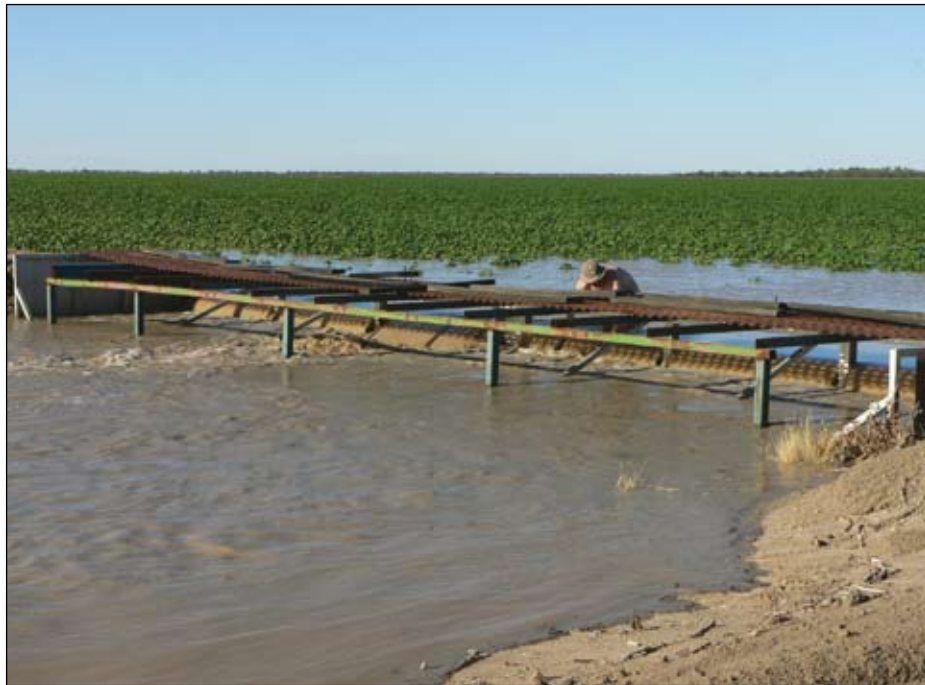
A bankless channel field at Bullamon Plains.