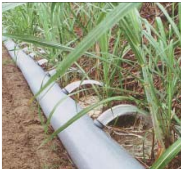
Lay flat fluming irrigating sugarcane.