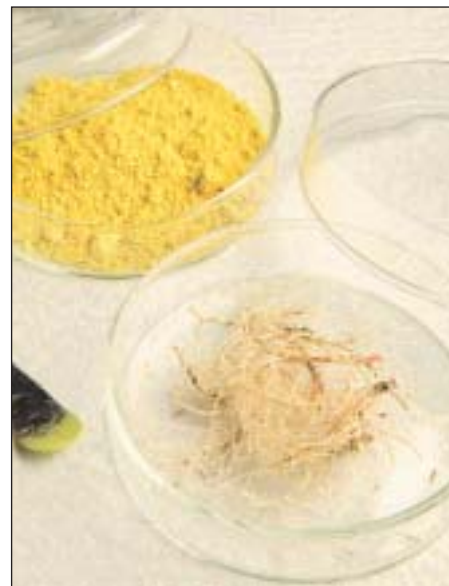
In foreground, freeze-dried cotton hairy roots (from which gossypol is extracted). In background, gossypol (in powdered form). Gossypol is a yellow pigment that accumulates in a cotton plant's outer tissues. The pigment is being investigated not only for its abilities to suppress numerous microbes, parasites, fungi, and insects, but also for inhibiting growth of some cancers.

But, by far, most of the interest is focused on a yellow pigment — gossypol — produced by the cotton plant's prolific roots. Also found in cotton seeds, leaves, and stems, this pigment accumulates in the plant's outer tissues to shield them from damaging insects. And because of its bitter