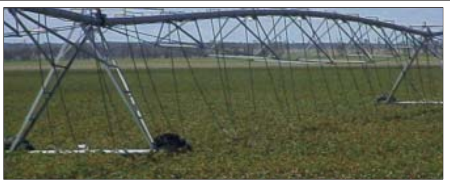
The visual tool will help extension officers and consultants determine optimum CP&LM design and management combinations for various soils.