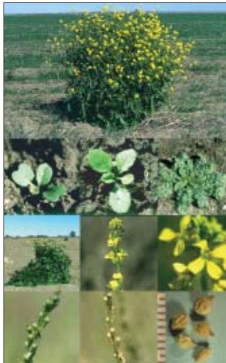
Turnip weed has additional images on the internet that assist with identification.

The weed identification unit of WEEDpak on the web has been updated.