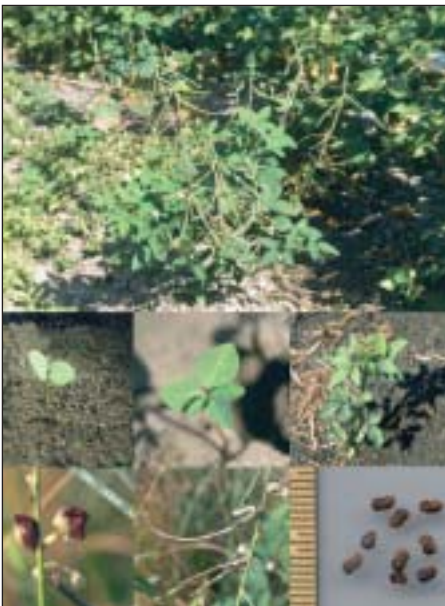
Phasey bean is one of the new weeds covered in WEEDpak.

WEEDpak is also available as part of the COTTONpaks CD from the same sources. The COTTONpaks CD is a compilation of all the cotton paks on a single CD. This makes it not only readily accessible from any computer, but also fully searchable. A simple search tool on the CD allows any term to be searched throughout all the cotton paks. So you don't have to remember