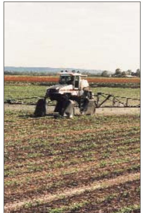
There weren't many suitable spraying days last season.