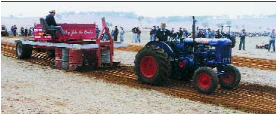
The tractor pull competition, held on the Saturday, provided fascinating entertainment for the spectators. Pictured is a petrol/kero Fordson E27N, driven by an obviously experienced operator who knew how to coax his old tractor into a commanding position in its class. Interestingly, a souped-up snarling hot-rod, which pretended to be an Allis Chalmers but in fact resembled a cross between a dragster and a pensioned off rickshaw, failed to move the sled off the mark.

The official registration tent was staffed by a squad of overworked, overstressed and greatly harassed ladies, each of whom should be awarded Australian of the Year in recognition of their dedication, patience and good cheer. Somehow they dealt with an endless queue of tractor drivers, anxious to register and be told where to go (politely no doubt). A pretty lady in red with a charming smile but the stoicism of a New York cop, insured that each tractor was