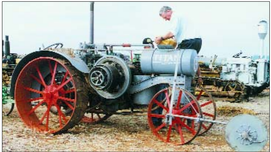
An International Titan being made ready for the challenge. Note the front mounted self steer device and also the exposed final drive sprocket and chain.

A mere four months later, the land of the shamrock and foaming black Guinness stunned us all by amassing 1,832 tractors — thus easily snatching the record from the South Africans. An astonishing number of tractors indeed, but it was also incredible that Ireland could find a paddock