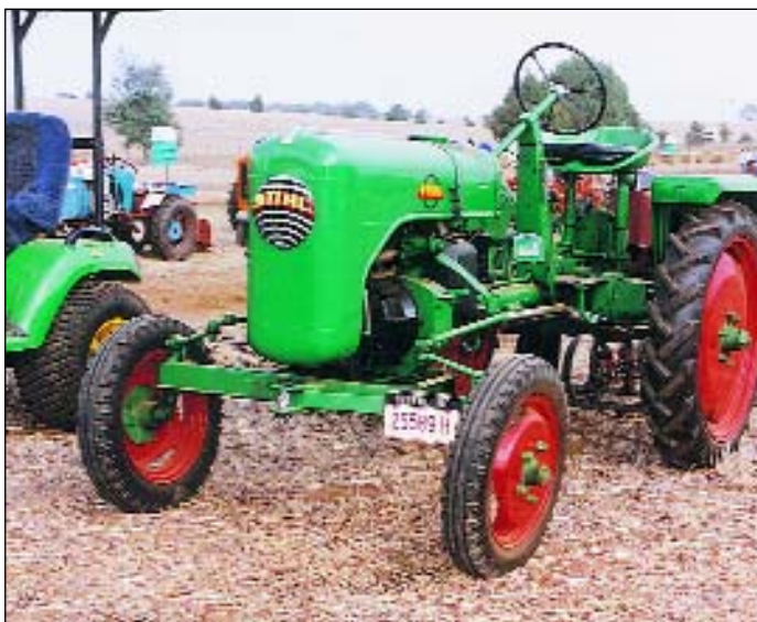
In Australia the German firm of Stihl is noted for its range of chain saws and few are aware of its early involvement with tractors. This ultra rare 1954 Stihl tractor, with its single cylinder 763 cc air cooled 14 hp engine, has been imported by classic tractor collector Howard Pryor