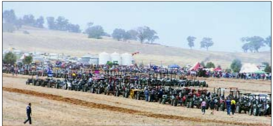
Although the estimates vary, approximately 300 Fergusons lined up for the record attempt. The photo shows a portion of the Ferguson parking area, with a few Massey Fergusons thrown in for good measure.

By Saturday morning around 1,000 tractors had been admitted into the arena by the Red Lady. Trucks continued pouring into the unloading area at the rate of one a