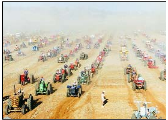
They're off! 1,897 tractors responded to the flashing lights of the starting vehicles. A certain female pedestrian looks somewhat confused as she checks her street directory. "Is this really the main street of Cootamundra?"