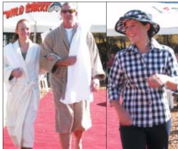
It was smiles all round as the volunteer models strutted their stuff on the red carpet.