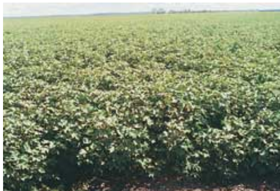
High yielding crops also have good compensation potential.