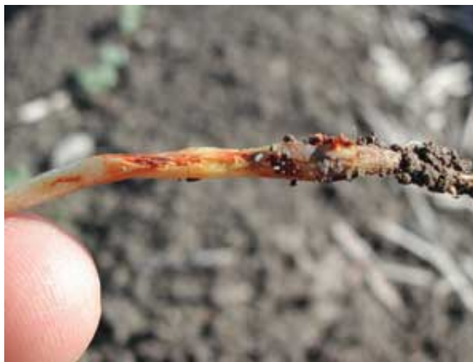
Pythium causes a soft-rot on the hypocotyl.

Newly emerged plants are vulnerable to post-emergent damping off because the cells in the hypocotyl and tap root are still thickening their walls and cementing themselves together. Later, the seedlings become resistant. Damping-off by Rhizoctonia and Pythium rarely occurs in older seedlings (after the two-leaf stage) except with very cool wet conditions. In contrast, the Fusarium wilt fungus can kill cotton plants at any