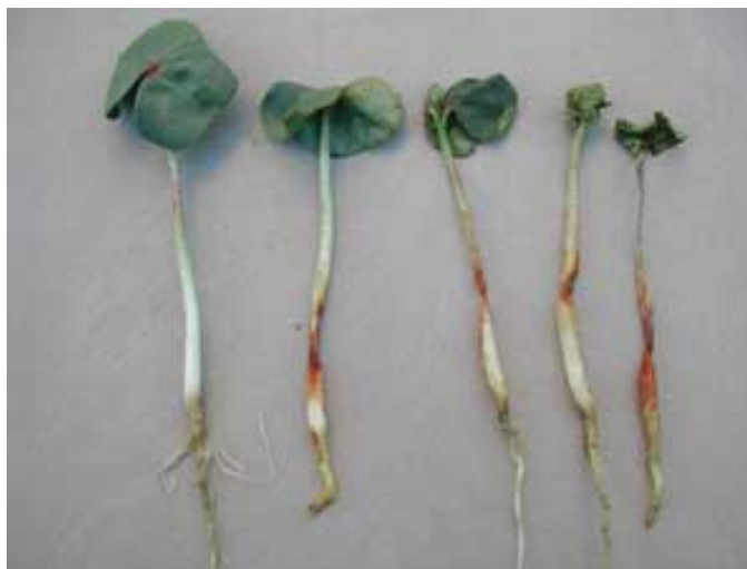
Severe infections of the hypocotyl by Pythium coincided with the cold snap in November (healthy seedling at left).

Seedling mortality was much lower in any treatment that included metalaxyl, which is active against Pythium but not Rhizoctonia . PCNB by itself had no effect on mortality. So in this particular trial, the disease pressure was dominated by Pythium . In other years and at other sites Rhizoctonia has been the major