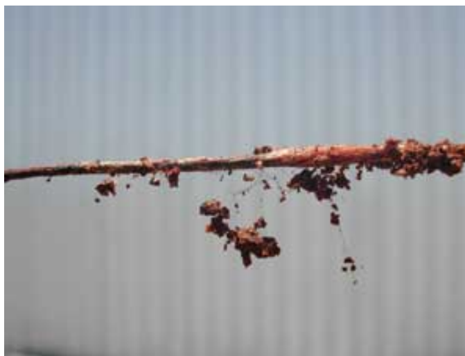
'Dancing soil' on the hypocotyl is characteristic of Rhizoctonia .