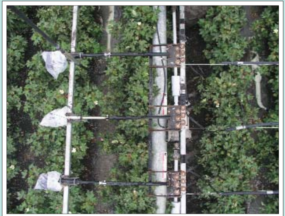
An overhead view of the electric ram and pulley arrangement used to move the sub-mains across or back one metre and reposition the socks beneath them on the opposite side of the plant row.