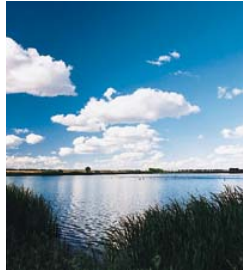
Australian agriculture needs to back up its claim of producing 'clean and green commodities'.

The international standard for environmental management systems, ISO 14001, is the preferred system for many industries and for many of our trading partners. It is a non-specific standard able to be adapted to any organisation that has significant environmental risks. It is focused on continuous improvement and sustainability within the organisation and the