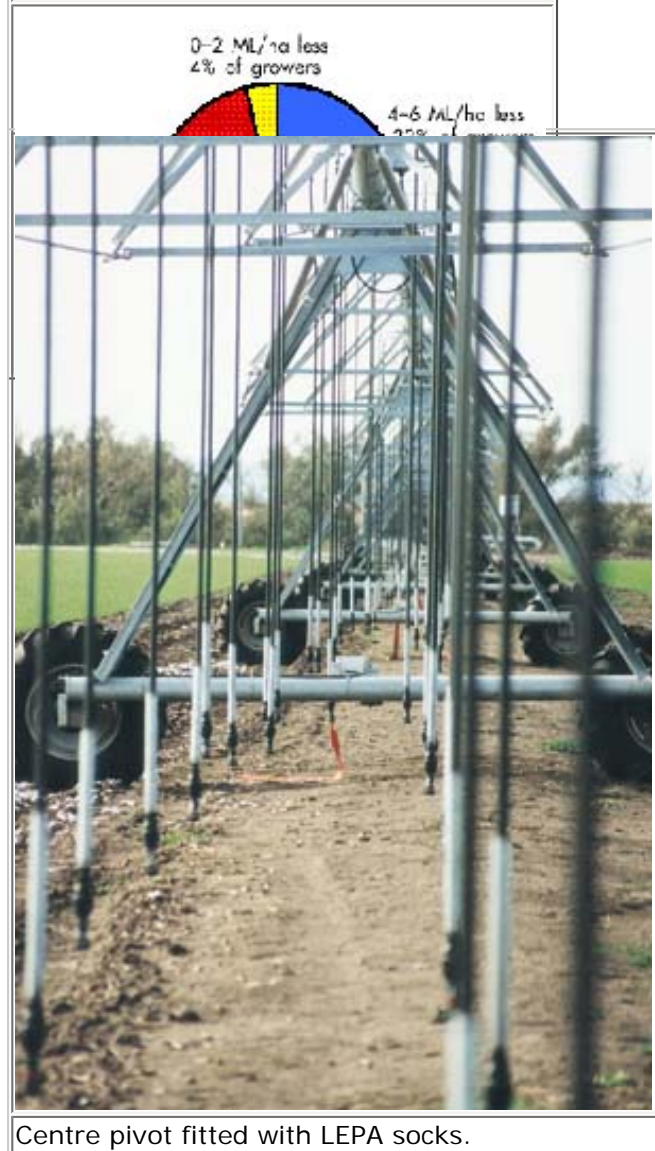
Centre pivot fitted with LEPA socks.