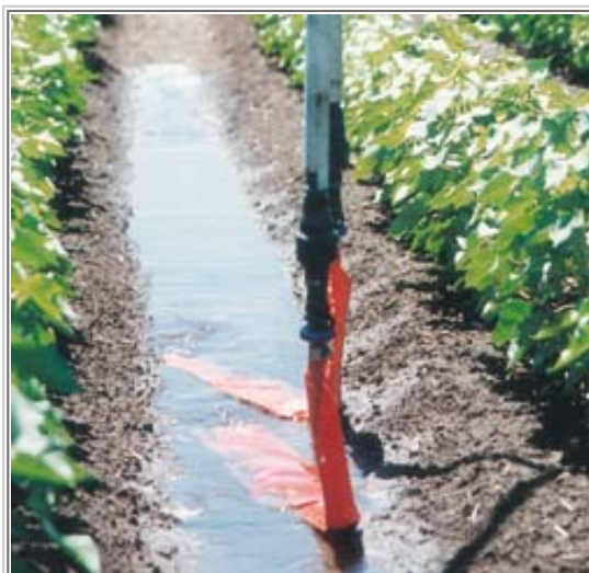
Using low energy precision application (LEPA) socks to irrigate cotton.

The main reasons cited for installing the